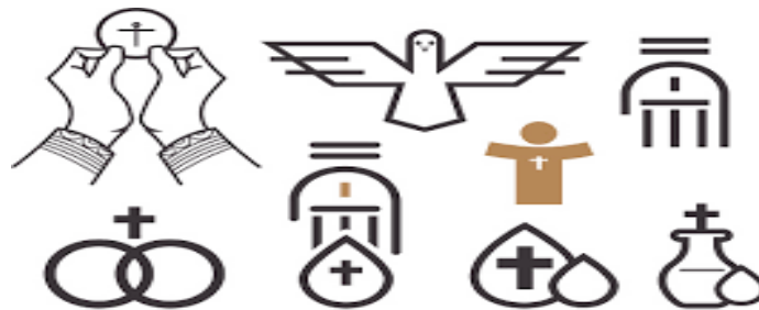
Sacraments symbol and icons set