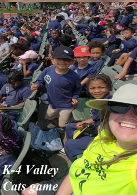
K-4 Valley Cats game