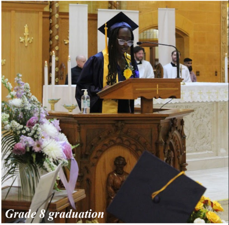
Grade 8 graduation

*Did you know that there are plenty of ways to support our school even over the summer months? Visit our school’s website at www.blessedsacramentschool.net and click the “About” tab, then “About Us,” and then “Support Our School” on the lower right-side menu.